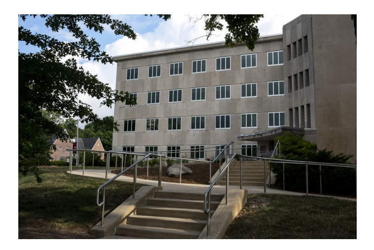
Students at Indiana University at Bloomington said they have trouble accessing care at the campus health center, above.

Student health centers are akin to the Wild West of medical care. There are no national regulations, and most are not licensed by states. Only about 220 campus medical clinics of the thousands nationwide are accredited by outside health organizations as meeting best practices, according to a Post analysis. In one case, Georgetown University stated on its website that its student health center was accredited but removed the claim after being asked about it by reporters.